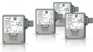
UL 924 ZONE CONTROLLER (XFAC)