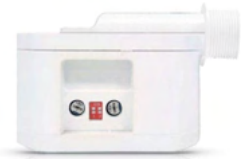
MICROWAVE (IP65 ENCLOSURE)