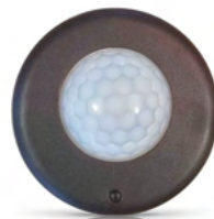
DIRECT CONNECT OUTDOOR PIR