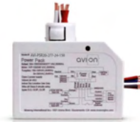
24V POWER SUPPLY (20A RELAY)