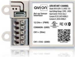
DIRECT CONNECT LVFA