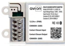
RELAY CLOSURE OUTPUT