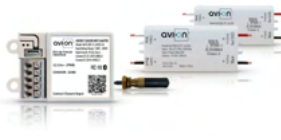
UL 924 NORMAL POWER BEACON (SIM)