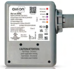
DIRECT CONNECT XFAC