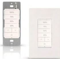
DIMMING WALL STATION