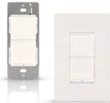
2 BUTTON WALL STATION