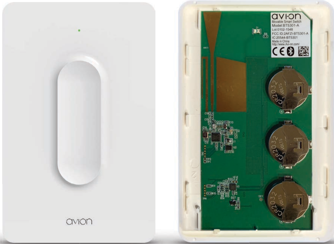
Figure 2. Avi-on Movable Switch ( Front & Battery View)

ALL PRODUCT, PRODUCT SPECIFICATIONS AND DATA ARE SUBJECT TO CHANGE WITHOUT NOTICE TO IMPROVE RELIABILITY, FUNCTION OR DESIGN OR OTHERWISE. The information contained herein is believed to be reliable. Avi-on makes no warranty, representation or guarantee regarding the information contained herein, the suitability of the products for any particular purpose, or the continuing production of any product. Avi-on assumes no responsibility or liability whatsoever for the use of the information contained herein. The information contained herein, or any use of such information does not grant, explicitly or implicitly, to any party any patent rights, licenses, or any other intellectual property rights, whether with regard to such information itself or anything described by such information.