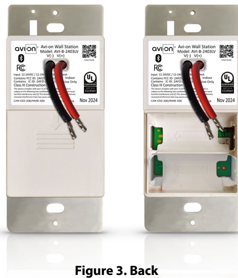
Figure 3. Back

ALL PRODUCT, PRODUCT SPECIFICATIONS AND DATA ARE SUBJECT TO CHANGE WITHOUT NOTICE TO IMPROVE RELIABILITY, FUNCTION OR DESIGN OR OTHERWISE. The information contained herein is believed to be reliable. Avi-on makes no warranty, representation or guarantee regarding the information contained herein, the suitability of the products for any particular purpose, or the continuing production of any product. Avi-on assumes no responsibility or liability whatsoever for the use of the information contained herein. The information contained herein, or any use of such information does not grant, explicitly or implicitly, to any party any patent rights, licenses, or any other intellectual property rights, whether with regard to such information itself or anything described by such information.