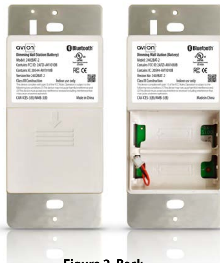
Figure 2. Back

ALL PRODUCT, PRODUCT SPECIFICATIONS AND DATA ARE SUBJECT TO CHANGE WITHOUT NOTICE TO IMPROVE RELIABILITY, FUNCTION OR DESIGN OR OTHERWISE. The information contained herein is believed to be reliable. Avi-on makes no warranty, representation or guarantee regarding the information contained herein, the suitability of the products for any particular purpose, or the continuing production of any product. Avi-on assumes no responsibility or liability whatsoever for the use of the information contained herein. The information contained herein, or any use of such information does not grant, explicitly or implicitly, to any party any patent rights, licenses, or any other intellectual property rights, whether with regard to such information itself or anything described by such information.