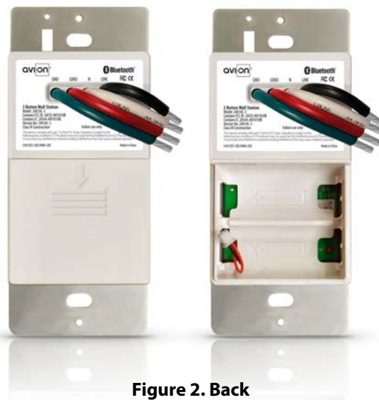
Figure 2. Back

ALL PRODUCT, PRODUCT SPECIFICATIONS AND DATA ARE SUBJECT TO CHANGE WITHOUT NOTICE TO IMPROVE RELIABILITY, FUNCTION OR DESIGN OR OTHERWISE. The information contained herein is believed to be reliable. Avi-on makes no warranty, representation or guarantee regarding the information contained herein, the suitability of the products for any particular purpose, or the continuing production of any product. Avi-on assumes no responsibility or liability whatsoever for the use of the information contained herein. The information contained herein, or any use of such information does not grant, explicitly or implicitly, to any party any patent rights, licenses, or any other intellectual property rights, whether with regard to such information itself or anything described by such information.